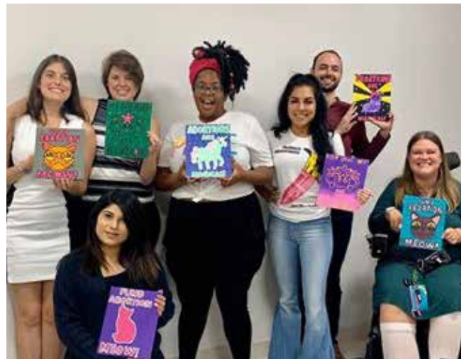
Abortion Sip & Paint