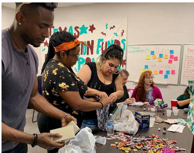
Abortion aftercare Kit making