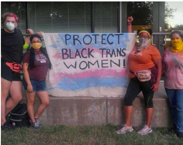
Black led BLM Rally