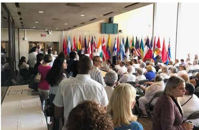
Women's Issues Network celebration of the 99th anniversary of the 19th amendment.