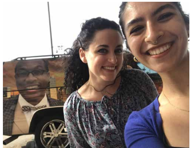
Gathering outside of the Dallas County Commissioners Court

Our Repro Power coalition has been doing a lot of work to have Rosie's Resolution passed by the Dallas County Commissioners Court with much resistance from allied leaders. We were able to use our coalition work to cultivate champions. This coalition of ACLU, Avow, Planned Parenthood of Greater Texas and TEA Fund worked with the Dallas County Commissioners Court to support a resolution titled Rosie's Resolution, that seeks for the Dallas County Commissioners Court to affirm abortion is healthcare. The COVID-19 pandemic has slowed a lot of our advocacy work, yet we are still working to meet with the commissioners virtually.