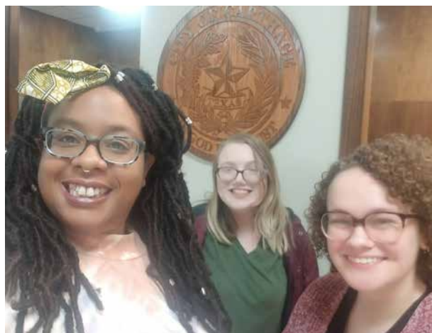
TEA Fund advocating for abortion access in Carthage, TX

We also made candles for our volunteer holiday party that read "Abortions Are Magical" and posted them on Instagram and got a lot of feedback from that.