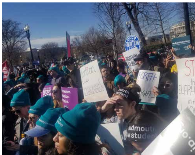
June vs. Medical Supreme Court case Rally