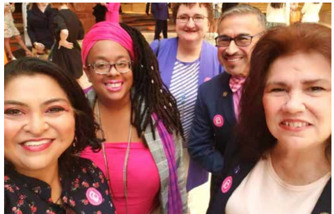
Planned Parenthood luncheon