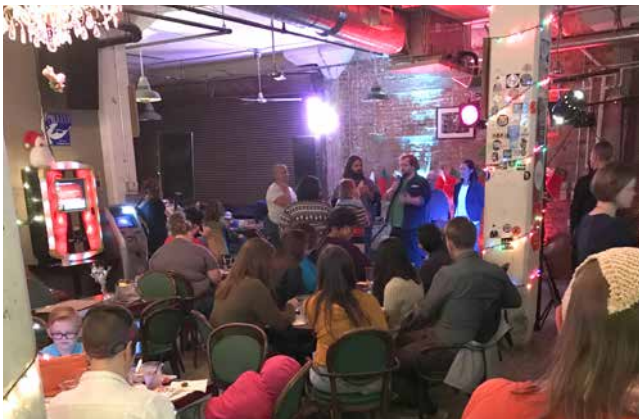
Fort Worth Soup