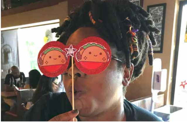
Taco or Beer Challenge