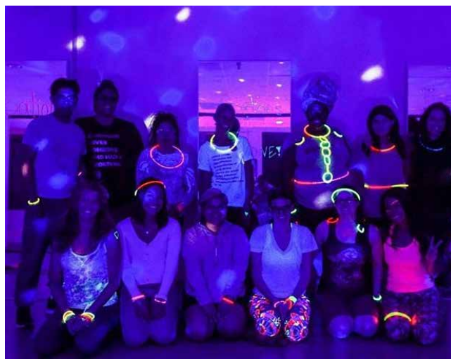
Glow with the flow yoga