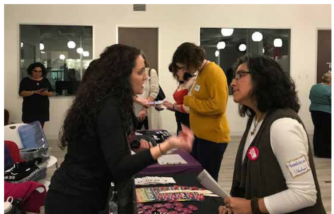
Our Bodies Our Lives