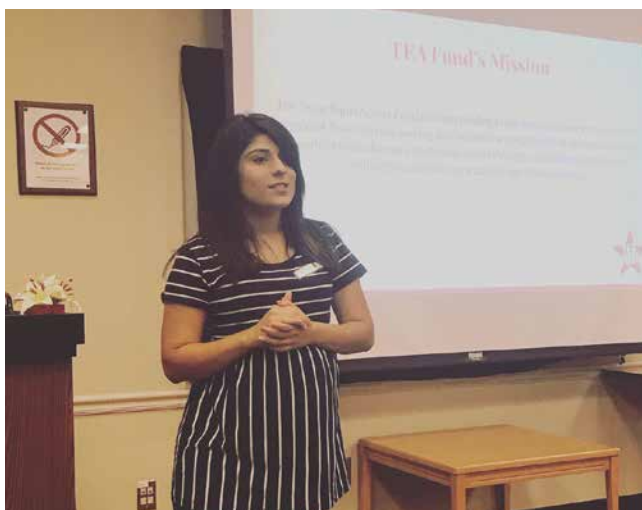
Local Advocacy day in Denton