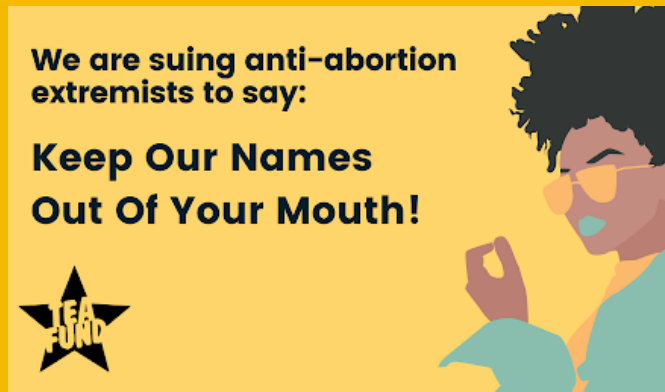
ACLU suit launch

In 2019, the town of Waskom, Texas created a local abortion ban which was the first Texas town to co-opt language from progressive organizations to limit abortion access at the local level, deeming themselves "a sanctuary city for the unborn", ultimately attempting to ban abortions in that town and prohibit the work of abortion forward organizations from serving individuals in these towns punishable by legal action.