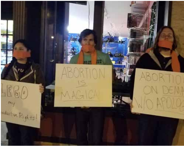
Silent protest - Lego