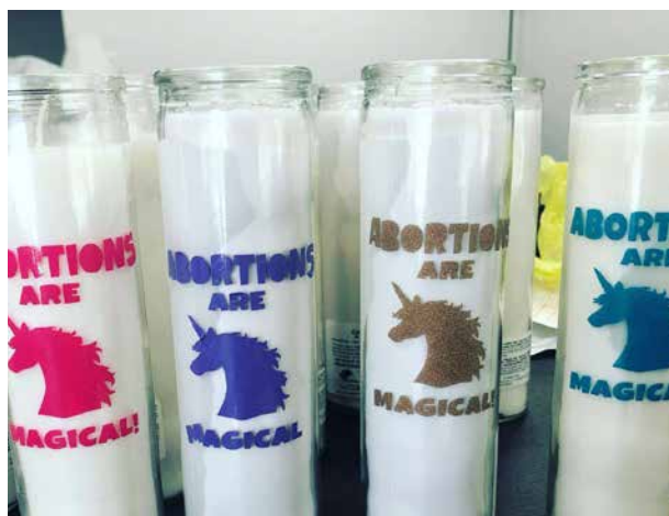
Abortions candles TEA Fund made for our volunteer holiday party