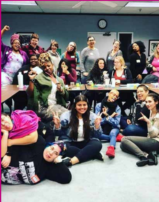
Abortion doulas receiving thier training

Our clinic defense program provides support to abortion clinics and patients who must walk through anti-abortion extremist protesters to access care. This program consists of two parts: clinic escorts and legal observers. Our clinic escorts accompany patients to the clinic doors while our legal observers document any violations or trespassing by extremists.