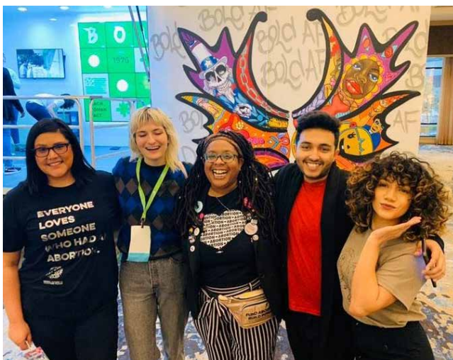
TEA Fund was the 1st stop on the All Above All Be the Bold Bus tour