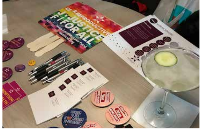
Bar 10 mixer in Fort Worth