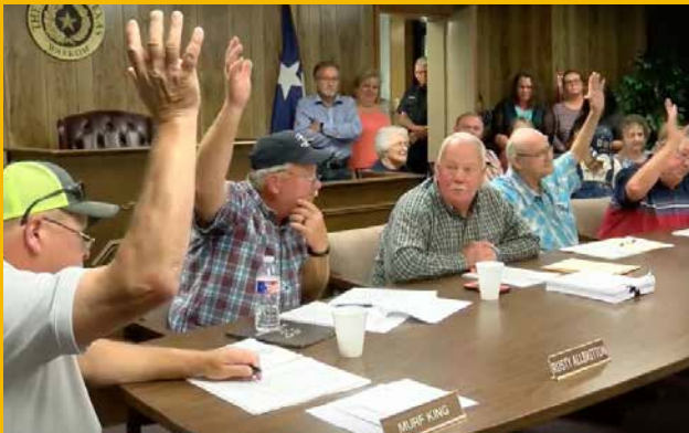
Officials in Waskom, TX voting to ban abortion